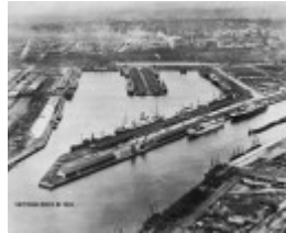
1 victoria dock in 1925