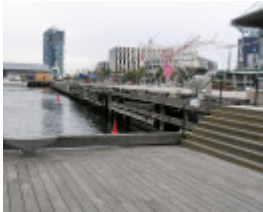
VICTORIA DOCK SOHE 2008