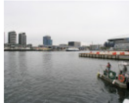
VICTORIA DOCK SOHE 2008