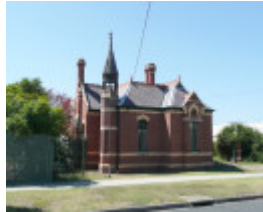
ST ALBANS HOMESTEAD GATE LODGE SOHE 2008