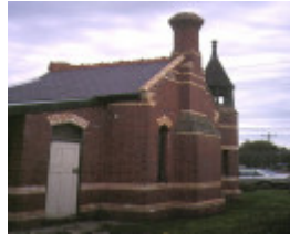
1 st albans homestead gate lodge whittington side view may1995