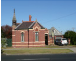
ST ALBANS HOMESTEAD GATE LODGE SOHE 2008