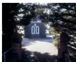
h01903 st davids lutheran church and cemetery anglesea rd freshwater creek front view she project 2003