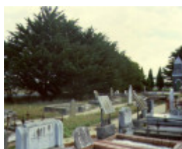
1 st davids freshwater ac2 june00