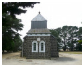
ST DAVID'S LUTHERAN CHURCH AND CEMETERY SOHE 2008