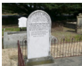
ST DAVID'S LUTHERAN CHURCH AND CEMETERY SOHE 2008