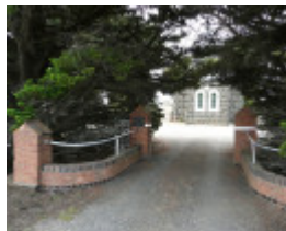
ST DAVID'S LUTHERAN CHURCH AND CEMETERY SOHE 2008