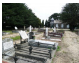
ST DAVID'S LUTHERAN CHURCH AND CEMETERY SOHE 2008