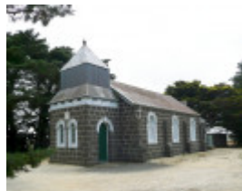
ST DAVID'S LUTHERAN CHURCH AND CEMETERY SOHE 2008