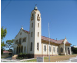
HOLY SPIRIT CHURCH SOHE 2008