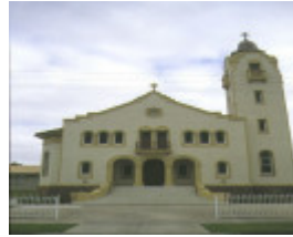
1 holy spirit church bostock avenue manifold heights front view apr1997