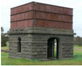
Lethbridge Railway Watertank