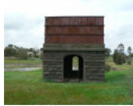
View of Lethbridge Railway Watertank and reservoir