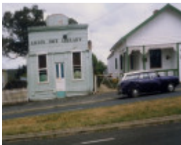
Linton Public Library c.1986.