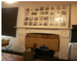
Linton Public Library 67 Sussex St Linton, living room mantel piece