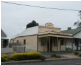
Linton Public Library 67 Sussex St Linton, exterior