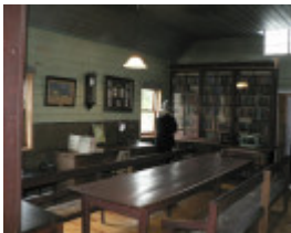
Linton Public Library 67 Sussex St Linton, interior