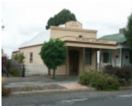
Linton Historical Society 2012