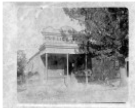
Linton Public Library, n.d