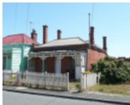
ST ELMO SOHE 2008