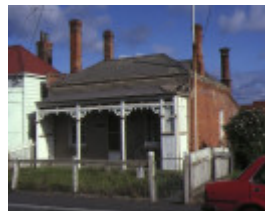
1 st elmo elizabeth street geelong front view apr1995