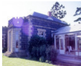
barwon bank riversdale road marnock vale newtown south east cnr she project 2004