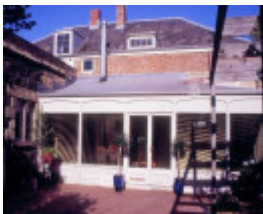
barwon bank riversdale road marnock vale newtown sunroom she project 2004