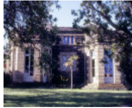
barwon bank riversdale road marnock vale newtown bay windows she project 2004