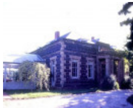
barwon bank riversdale road marnock vale newtown north east cnr she project 2004