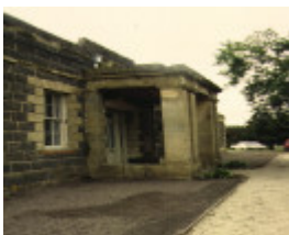
Barwon Bank Riversdale Rd Marnock Vale Newtown Front Entrance Sep 1977