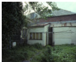
Barwon Bank Riversdale Rd Marnock Vale Newtown Kitchen Wing Sep 1977