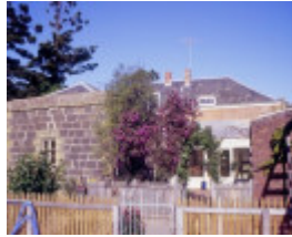
barwon bank riversdale road marnock vale newtown west elevations she project 2004