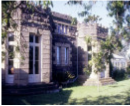
h00425 1 barwon bank riversdale road marnock vale newtown south west cnr she project 2004