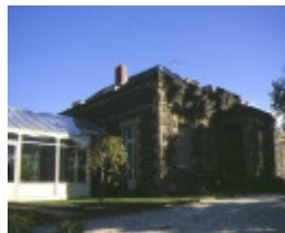
Barwon Bank Riversdale Rd Marnock Vale Newtown Additions 1997