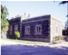
barwon bank riversdale road marnock vale newtown kitchen wing she project 2004