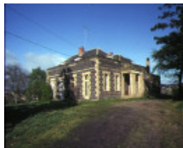
Barwon Park Riversdale Rd Marnock Vale Newtown Front View Sep 1977