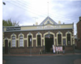
1 former duckers auction rooms geelong front view apr1997