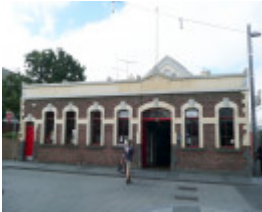
FORMER DUCKERS AUCTION ROOMS SOHE 2008