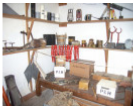
LIFEBOAT STATION SOHE 2008