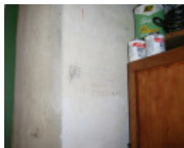
LIFEBOAT STATION SOHE 2008