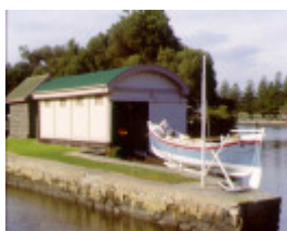
1 lifeboat station port fairy sw aug1999