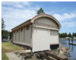
LIFEBOAT STATION SOHE 2008