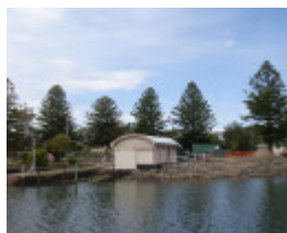
LIFEBOAT STATION SOHE 2008