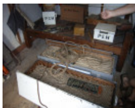
LIFEBOAT STATION SOHE 2008