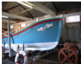
LIFEBOAT STATION SOHE 2008