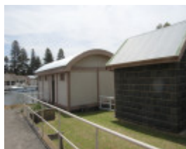
LIFEBOAT STATION SOHE 2008