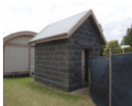
LIFEBOAT STATION SOHE 2008