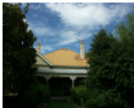
67 Mt Pleasant Road, Belmont