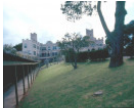
h02058 delgany portsea 1925 1953 1968 wings sept03 mz