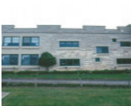
Delgany Portsea Join of 1953 and 1925 House September 2003