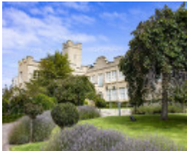
Delgany Castle with formal gardens