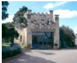
h02058 delgany portsea garage sept03 mz