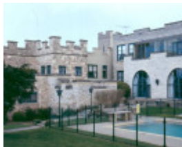
Delgany Portsea Rear of 1925, 1953 and 1968 Wings House September 2003