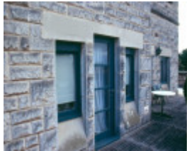
Delgany Portsea 1925 House Windows and Doors September 2003