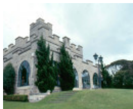
Delgany Portsea 1925 House September 2003