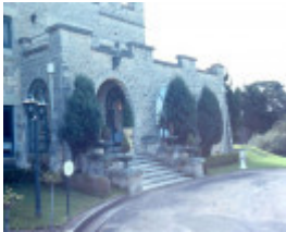
Delgany Portsea 1925 House September 2003