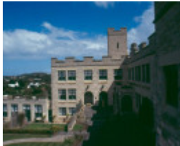
Delgany Portsea 1953 Wing September 2003