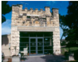
Delgany Portsea Garage September 2003