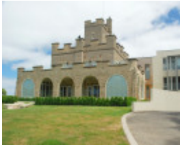
DELGANY SOHE 2008