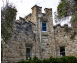
Delgany Garage image 1