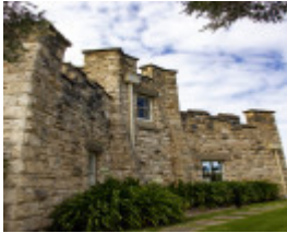
Delgany Garage image 3