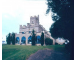
h02058 1 delgany portsea 1925 house sept03 mz