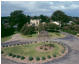
Delgany Portsea Drive September 2003