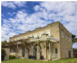
Delgany Castle image 4