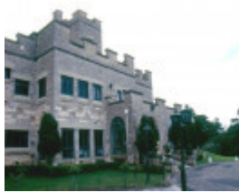
Delgany Portsea 1925 House September 2003