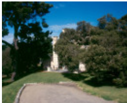
Delgany Portsea Garage and Drive September 2003