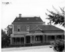
Golf Hill, taken Feb. 20, 1966.