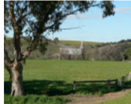
23706 Entrance to Golf Hill with the Presbyterian Church Shelford 223