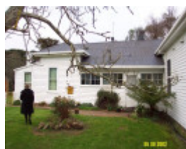
23419 Lovatdale Glenthompson courtyard 1237