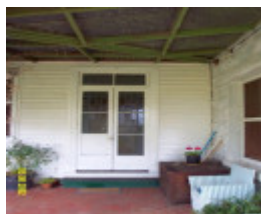
23419 Lovatdale Glenthompson detail of verandah 1234