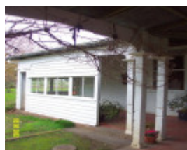
23419 Lovatdale Glenthompson detail of verandah 1235