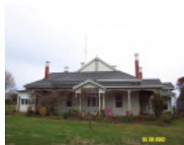
23419 Lovatdale Glenthompson facade 1232