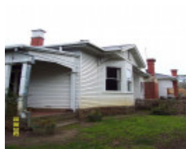
23419 Lovatdale Glenthompson west elevation 1229