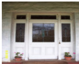
23419 Lovatdale Glenthompson front door 1231