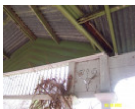
23419 Lovatdale Glenthompson detail of verandah 1236