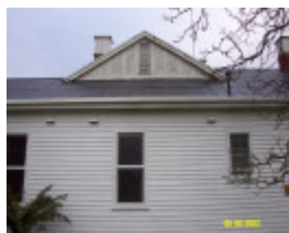
23419 Lovatdale Glenthompson west elevation 1238