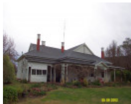
23419 Lovatdale Glenthompson facade 1233