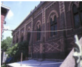
st judes church of england lygon street carlton side elevation dec1978