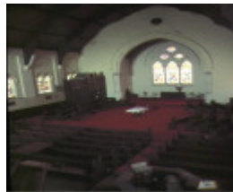
st judes church of england lygon street carlton interior