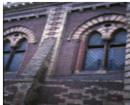
st judes church of england lygon street carlton window detail