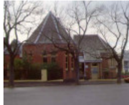
st judes church of england lygon street carlton halls sw jul99