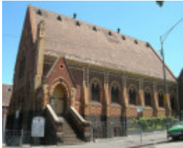
ST JUDES ANGLICAN CHURCH SOHE 2008