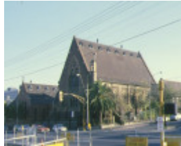
st judes church of england lygon street carlton front view