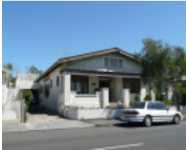
RESIDENCE SOHE 2008