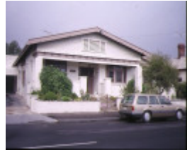
1 residence 9 gertrude street geelong front view sep1995