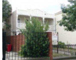
EUDOXUS SOHE 2008