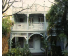
1 eudoxus gelong front view jul1995