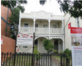
EUDOXUS SOHE 2008