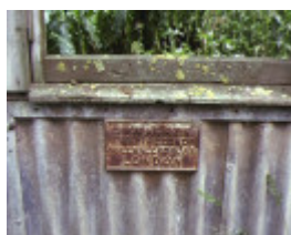
1 prefabricated iron cottage inverleigh detail of manufacturers label