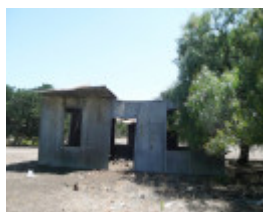
PREFABRICATED IRON COTTAGE SOHE 2008