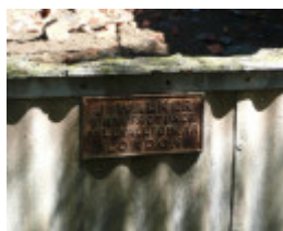
PREFABRICATED IRON COTTAGE SOHE 2008