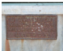
PREFABRICATED IRON COTTAGE SOHE 2008