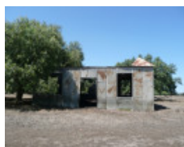
PREFABRICATED IRON COTTAGE SOHE 2008