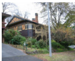
h02082 officer house eaglemont mz june2005 02