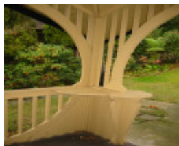
h02082 officer house eaglemont mz june2005 05