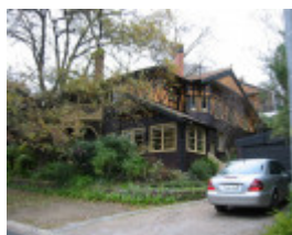
h02082 1 officer house eaglemont mz june2005 001