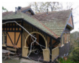
h02082 officer house eaglemont mz june2005 03