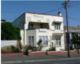
ST LEONARDS SOHE 2008