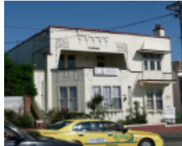
ST LEONARDS SOHE 2008