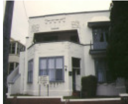
1 st leonards latrobe terrace newtown front view sep1995