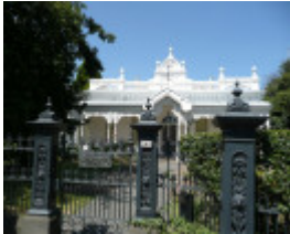
MIHARO SOHE 2008