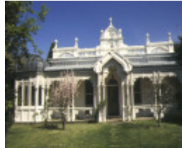
1 miharo noble street newtown front view sep1995