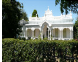
MIHARO SOHE 2008