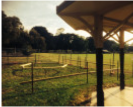
Before Photographs - Reference F3903 2015