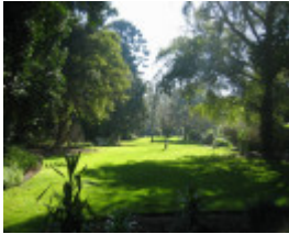
H2095 Geelong Bot Gardens 8.2005