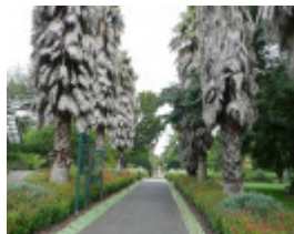
EASTERN PARK & GEELONG BOTANIC GARDENS SOHE 2008