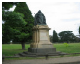
H2095 Eastern Park 10.2005 Queen Vic statue