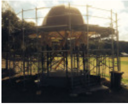
During Photographs - Reference F3903 2015