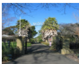
H2095 Geelong Bot Gardens 8.2005 Entry Gates