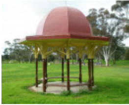
After Photographs - Reference F3903 2016