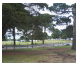
H2095 Eastern Park_10.2005