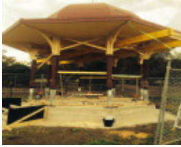
During Photographs - Reference F3903 2015