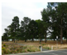
EASTERN PARK & GEELONG BOTANIC GARDENS SOHE 2008