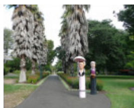
EASTERN PARK & GEELONG BOTANIC GARDENS SOHE 2008