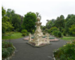
EASTERN PARK & GEELONG BOTANIC GARDENS SOHE 2008