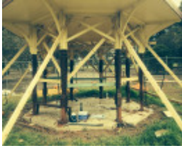
During Photographs - Reference F3903 2015