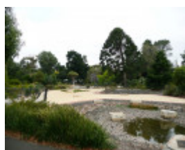
EASTERN PARK & GEELONG BOTANIC GARDENS SOHE 2008