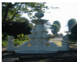
H2095 Geelong Bot Gardens 8.2005 Hitchcock Fountain