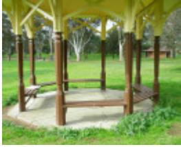
After Photographs - Reference F3903 2016