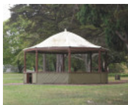
H2095 Eastern Park 10.2005 rotunda