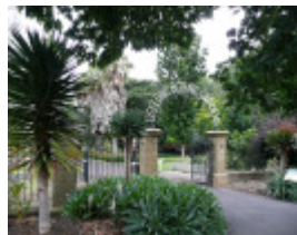
EASTERN PARK & GEELONG BOTANIC GARDENS SOHE 2008