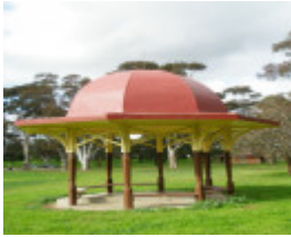
After Photographs - Reference F3903 2016