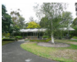
EASTERN PARK & GEELONG BOTANIC GARDENS SOHE 2008