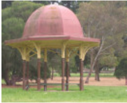
H2095 Eastern Park 29 10.2005 Former Ladies Kiosk