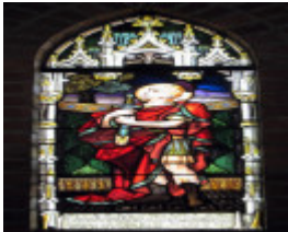
Myrtleford St Pauls Church Faith in Armour