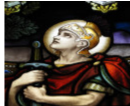
Myrtleford St Pauls Church Faith in Armour detail 1