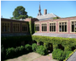
GEELONG COLLEGE SOHE 2008