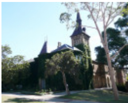
GEELONG COLLEGE SOHE 2008