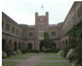
1 geelong college talbot street newtown cloisters nov1990