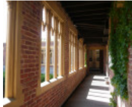
GEELONG COLLEGE SOHE 2008