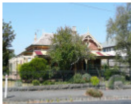
EYTHORNE SOHE 2008