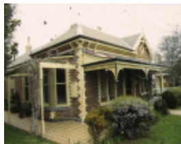
1 eythorne aphrasia street newtown front corner view aug1995