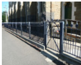
FORMER NEWTOWN METHODIST CHURCH SOHE 2008