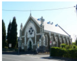
FORMER NEWTOWN METHODIST CHURCH SOHE 2008