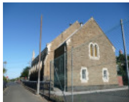
FORMER NEWTOWN METHODIST CHURCH SOHE 2008