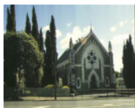
1 former newtown methodist church pakington street geelong front view aug1995