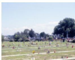
eastern cemetery gatehouse ormond road geelong cemetery she project 2003