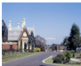
eastern cemetery gatehouse ormond road geelong driveway she project 2003