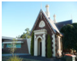
EASTERN CEMETERY GATEHOUSE SOHE 2008