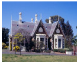
h01170 1 eastern cemetery gatehouse ormond road geelong gatehouse she project 2003