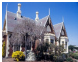
eastern cemetery gatehouse ormond road geelong close up she project 2003