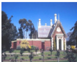
eastern cemetery gatehouse ormond road geelong garden she project 2003