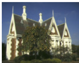
h01170 eastern cemetery gatehouse ormond road geelong front view