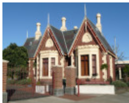
EASTERN CEMETERY GATEHOUSE SOHE 2008