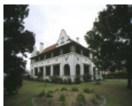
1 ashby presbytery of st peter & st paul geelong side view apr1997