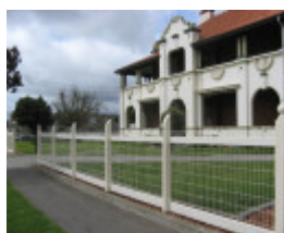
Miscellaneous photos Oct 2010 037.jpg