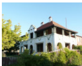
ASHBY PRESBYTERY OF ST PETER AND ST PAUL SOHE 2008