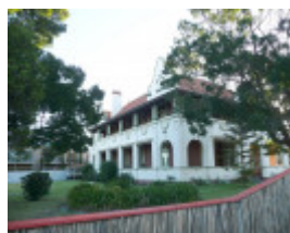
ASHBY PRESBYTERY OF ST PETER AND ST PAUL SOHE 2008