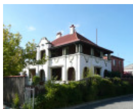
ASHBY PRESBYTERY OF ST PETER AND ST PAUL SOHE 2008