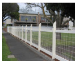
Miscellaneous photos Oct 2010 034.jpg