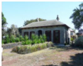
MELALEUKA SOHE 2008