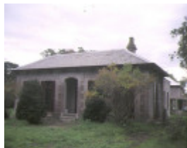
1 melaleuka leopold front elevation may1995