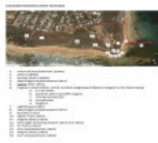
buildings and features.JPG