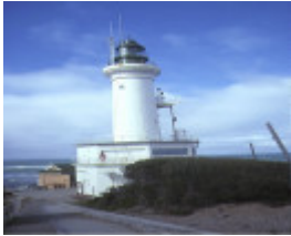
1 point lonsdale lighthouse point lonsdale front view aug1984