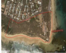
aerial view extent of registration.jpg