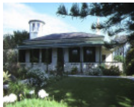
1 roseville cottage mercer street queenscliff front view