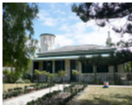
ROSEVILLE COTTAGE SOHE 2008