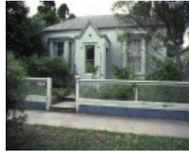
1 rosenfeld king street queenscliff front view mar1984