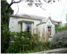
ROSENFELD SOHE 2008