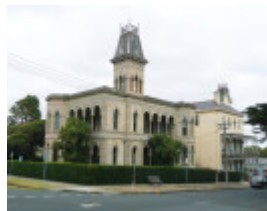
LATHAMSTOWE SOHE 2008