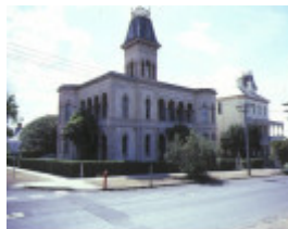
1 lathamstowe gellibrand street queenscliff front view