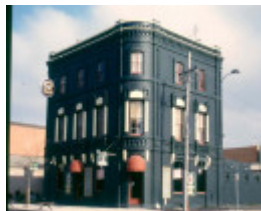
Golden Age Hotel Geelong Front