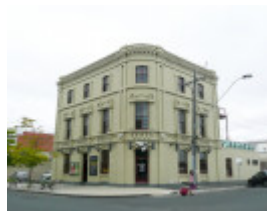
GOLDEN AGE HOTEL SOHE 2008