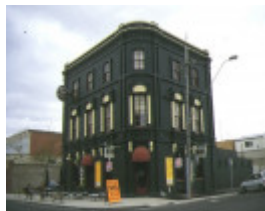
1 golden age hotel geelong front view apr1997