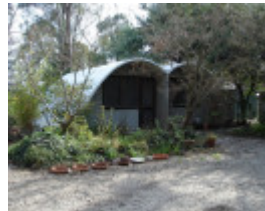
14272 Rice House Eltham May 06 childrens house