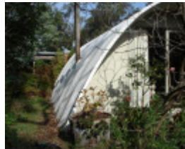
14272 Rice House Eltham May 06 Main house detail