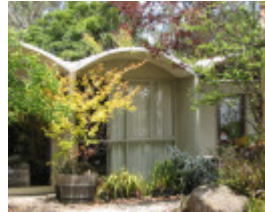
RICE HOUSE SOHE 2008