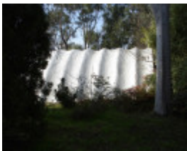
14272 Rice House Eltham May 06 main house side view