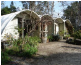
14272 Rice House Eltham May 06 main house