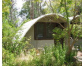
RICE HOUSE SOHE 2008