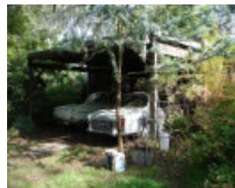
14272 Rice House Eltham May 06 carport