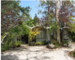
RICE HOUSE SOHE 2008