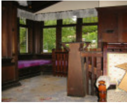
h01033 east view heidleberg entry window seats 02 nov2004 mz