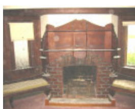
h01033 east view heidelberg living room 03 nov2004 mz