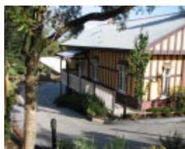
EAST VIEW SOHE 2008