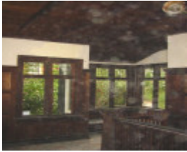
h01033 east view heidleberg entry window seats 01 nov2004 mz