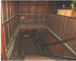
h01033 east view heidleberg stairs 02 nov2004 mz