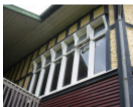
h01033 east view heidelberg windows nov2004 mz