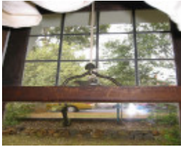
h01033 east view heidleberg window detail nov2004 mz