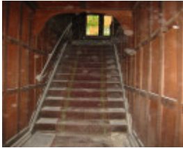
h01033 east view heidleberg stairs 01 nov2004 mz