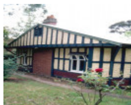
h01033 1 east view heidelberg front elevation 01 nov2004 mz