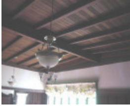
h01033 east view heidleberg cieling 01 nov2004 mz