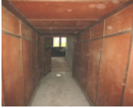
h01033 east view heidleberg tunnel nov2004 mz