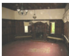
h01033 east view heidelberg living room 02 nov2004 mz