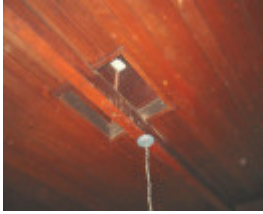
h01033 east view heidleberg ceiling vent nov2004 mz