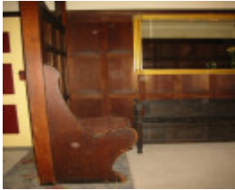
h01033 east view heidleberg screen seat nov2004 mz