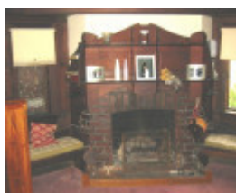
h01033 east view heidelberg living room 01 nov2004 mz