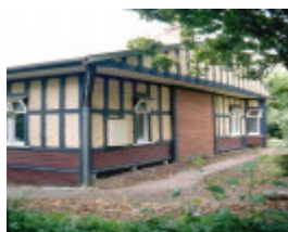
h01033 east view heidelberg front elevation 02 nov2004 mz