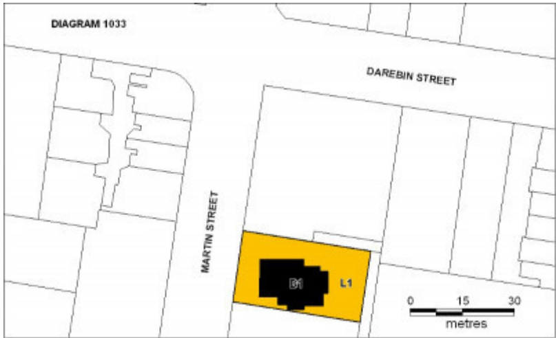
h01033 east view plan dec2004 mz