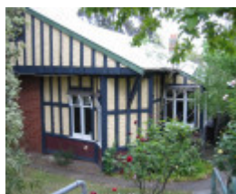
h01033 east view heidelberg front elevation 03 nov2004 mz