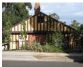
EAST VIEW SOHE 2008