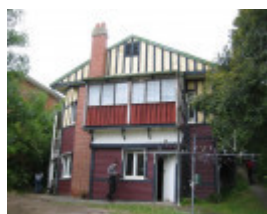
h01033 east view heidelberg rear elevation nov2004 mz