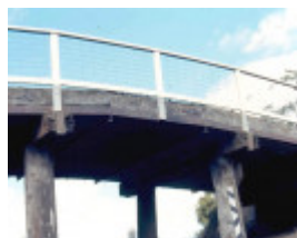
h02054 portland flat road bridge west ele centre span 0903 mz