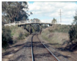
h02054 1 portland flat road bridge west ele 0903 mz