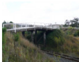
PORTLAND FLAT ROAD BRIDGE SOHE 2008