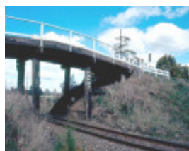
h02054 portland flat road bridge west ele south abutment 0903 mz