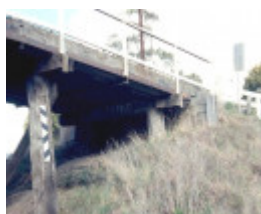
h02054 portland flat road bridge south abutment 0903 mz