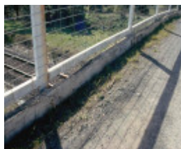
h02054 portland flat road bridge west kerb 0903 mz