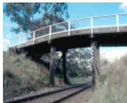
h02054 portland flat road bridge west ele north abutment 0903 mz