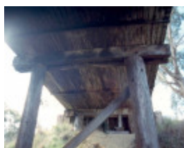
h02054 portland flat road bridge north abutment 0903 mz