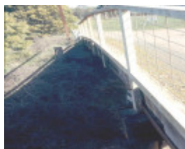
h02054 portland flat road bridge east kerb 0903 mz