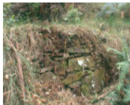
H02015 wheelers tramway retaining wall