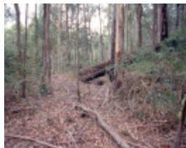
H02015 wheelers tramway