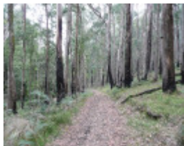
WHEELER'S TRAMWAY SOHE 2008