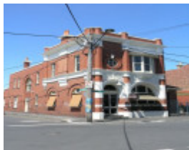
STATE SAVINGS BANK SOHE 2008