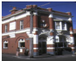
1 state savings bank ballarat street yarraville side view