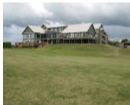
Barwon_Heads_Golf_Club_Jur from rear (west).jpg