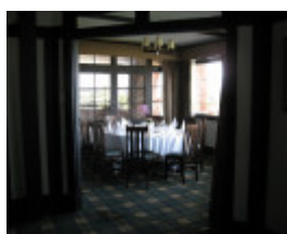
Barwon_Heads_Golf_Club_Jur dining alcove.jpg