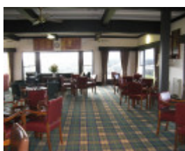
Barwon_Heads_Golf_Club_Jur main lounge.jpg