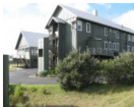
Barwon_Heads_Golf_Club_Jur new wings at rear.jpg