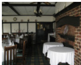
Barwon_Heads_Golf_Club_Jur dining room.jpg