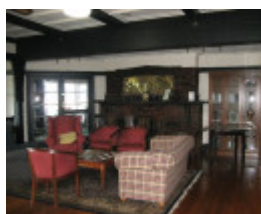
Barwon_Heads_Golf_Club_Jur main lounge.jpg