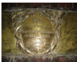
Barwon_Heads_Golf_Club_Jur brass plaque over fireplace.jpg