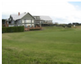
Barwon_Heads_Golf_Club_Jur view from north (2).jpg