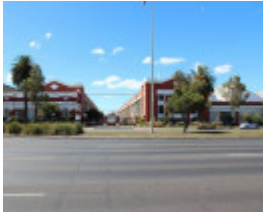
Ford Motor CompanyGeelong1