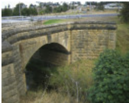
1 bridge over waurn ponds creek side view apr1997