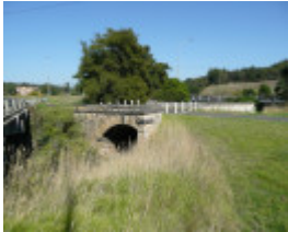
BRIDGE SOHE 2008