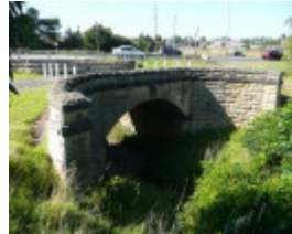
BRIDGE SOHE 2008