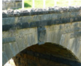
BRIDGE SOHE 2008