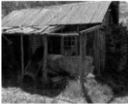
HO200 - Hill, later Birch farm complex - cottage from street