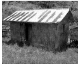
HO200 - Hill, later Birch farm complex - Standard design dairy erected in 1935