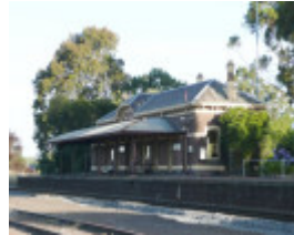
TERANG RAILWAY STATION SOHE 2008