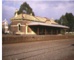
1 terang railway station terang trackside view may1995