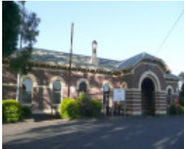
TERANG RAILWAY STATION SOHE 2008