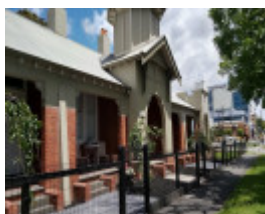
Alexander Miller Memorial Homes 2021