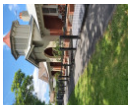
Alexander Miller Memorial Homes 2021