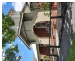
Alexander Miller Memorial Homes 2021