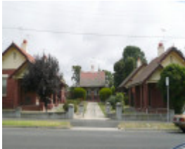
ALEXANDER MILLER MEMORIAL HOMES SOHE 2008