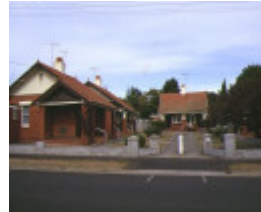
1 alexander miller memorial homes 22 park street geelong complex view apr1997