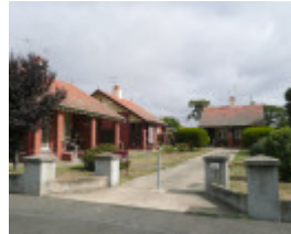
ALEXANDER MILLER MEMORIAL HOMES SOHE 2008