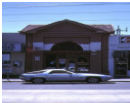
1 former south yarra railway station toorak road south yarra front view