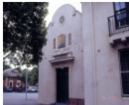
h01486 south melbourne court house and police station entry she project 2004