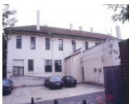
h01486 south melbourne court house and police station rear she project 2004