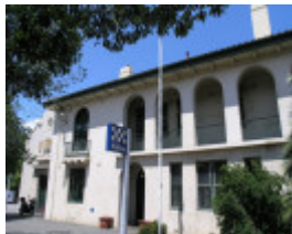
SOUTH MELBOURNE COURT HOUSE AND POLICE STATION SOHE 2008