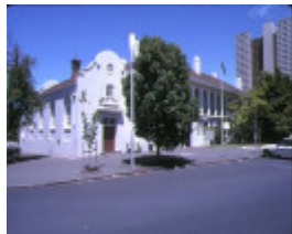
1 south melbourne court house & police station bank street south melbourne front view