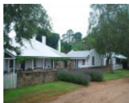
HABBIES HOWE HOMESTEAD SOHE 2008