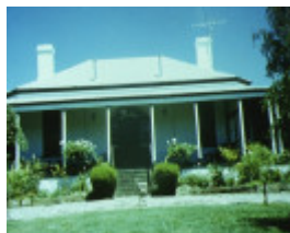
Habbies Howe Homestead Seymour Front View