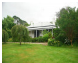
HABBIES HOWE HOMESTEAD SOHE 2008