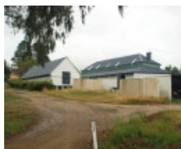
HABBIES HOWE HOMESTEAD SOHE 2008