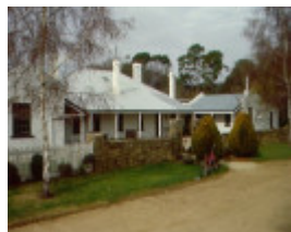
1 habbies howe 1999