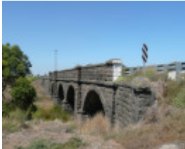
ROTHWELL BRIDGE SOHE 2008