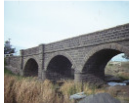
1 rothwell bridge over little river werribee side view jul1984